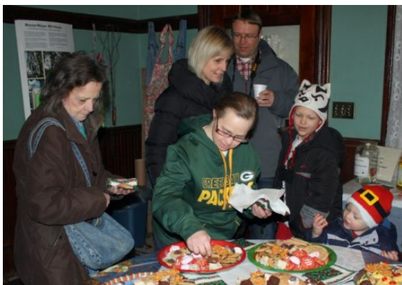
Homemade cookies filled the Mill House kitchen table. Cookies were served at both buildings along with hot and cold beverages.