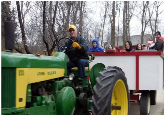
Visitors were treated to a wagon ride through the Park with stops at the Mill House for treats and caroling and at the Welcome Center to see Lofy’s General Store all decorated for Christmas.