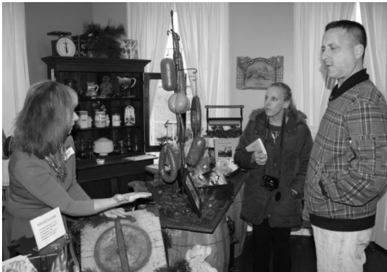
Volunteer behind General Store Counter

A special ‘thank you’ to all LWC committee members and volunteers for all your help and support. It was a great year!