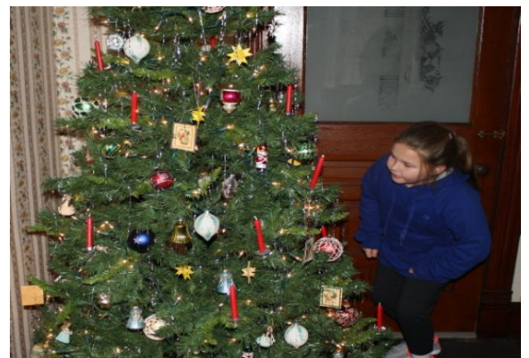
Finding the pickle ornament is an old German tradition; and if you found it on the Mill House tree, you won a prize.