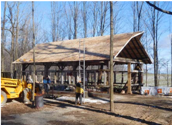
Blacksmith Shop under Construction

As Project Coordinator, I look forward to keeping our park a destination for families to enjoy. There are many opportunities to become involved and help us keep history alive for future generations.