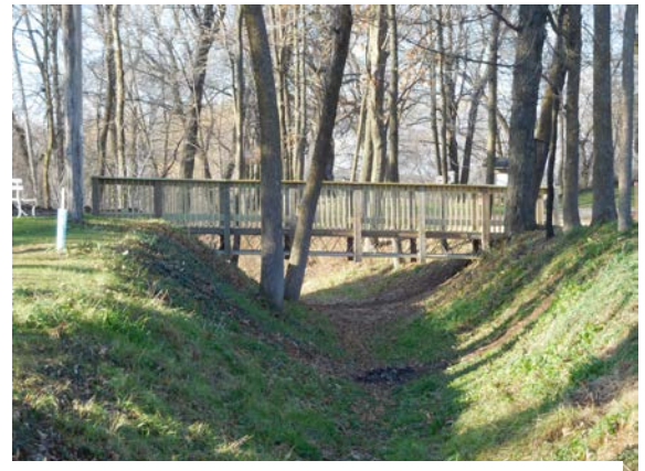
Bridge Connecting Mill House and Welcome Center