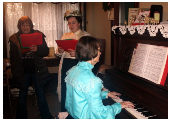
Christmas carols were played on the Mill House parlor piano and visitors sang along.